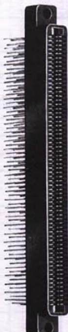
600-6PC64 64 Dual Contacts 128 Terminals